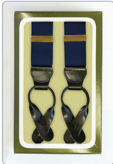
RE350 - EXECUTIVE CARTON